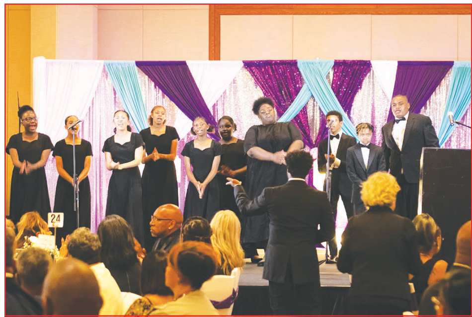
The Kansas City Boys & Girls Choirs perform.