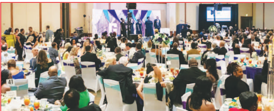
(Above) A crowd of nearly 500 listens as the Kansas City Boys & Girls Choirs perform.