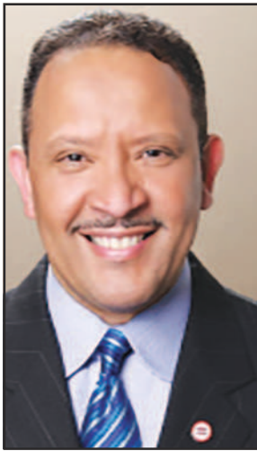
Marc C. Morial President/CEO National Urban League

“Friends today the Supreme Court got it wrong. I think this day will live in infamy. Because it was one of the most tortured opinions