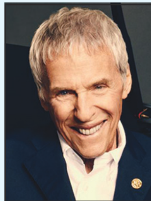
From left: Inductees Dionne Warwick and the late Burt Bacharach