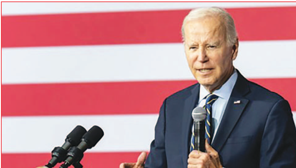
President Joe Biden