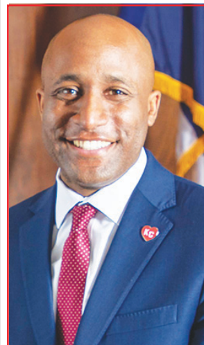
KCMO Mayor Quinton Lucas